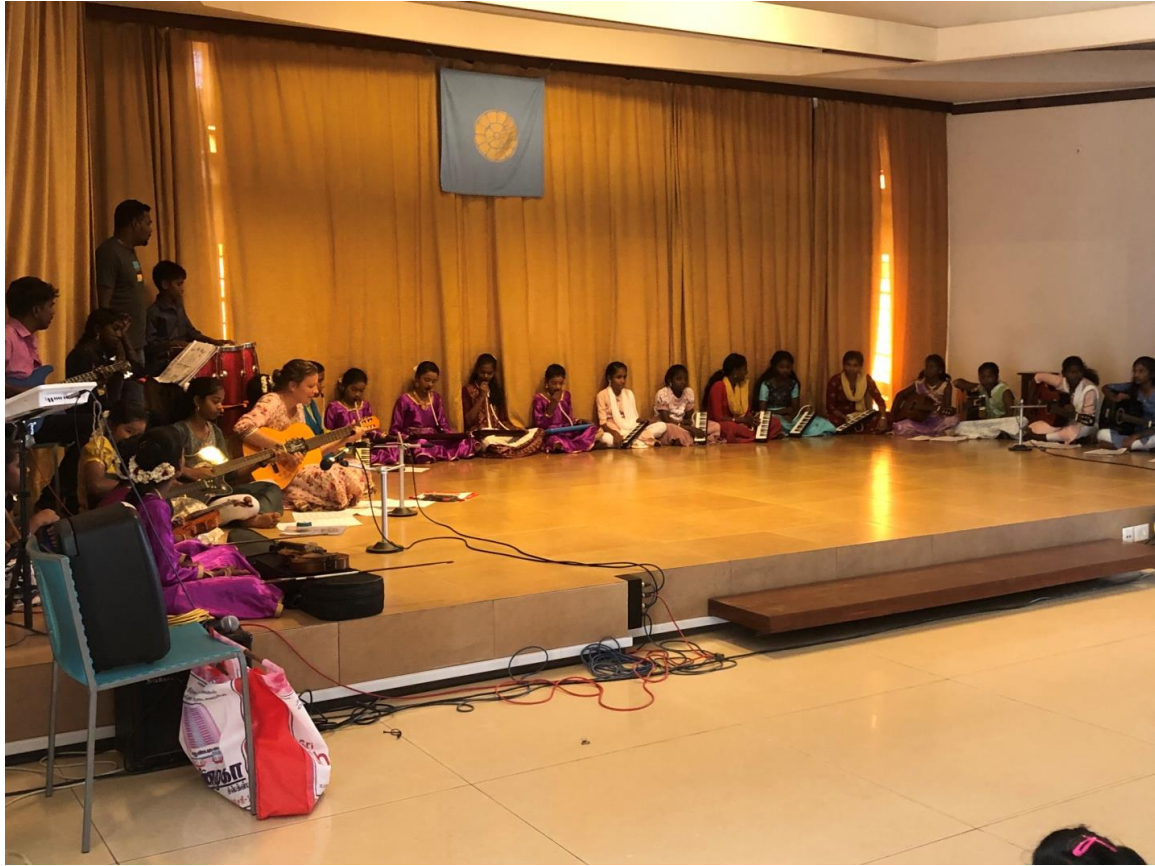
Unity Pavilion program 10 march 2024

Stage is yours program we did on 4 march 2024 in Pondicherry. The Phudupakkam kids from Isai ragam were participating. The program is for showing your talents.