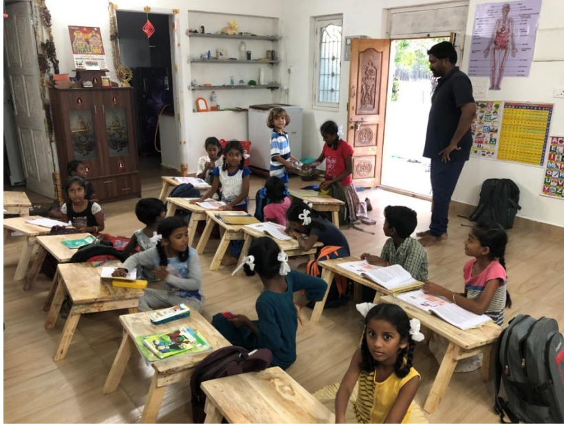
Homework classes Kottakarai colony