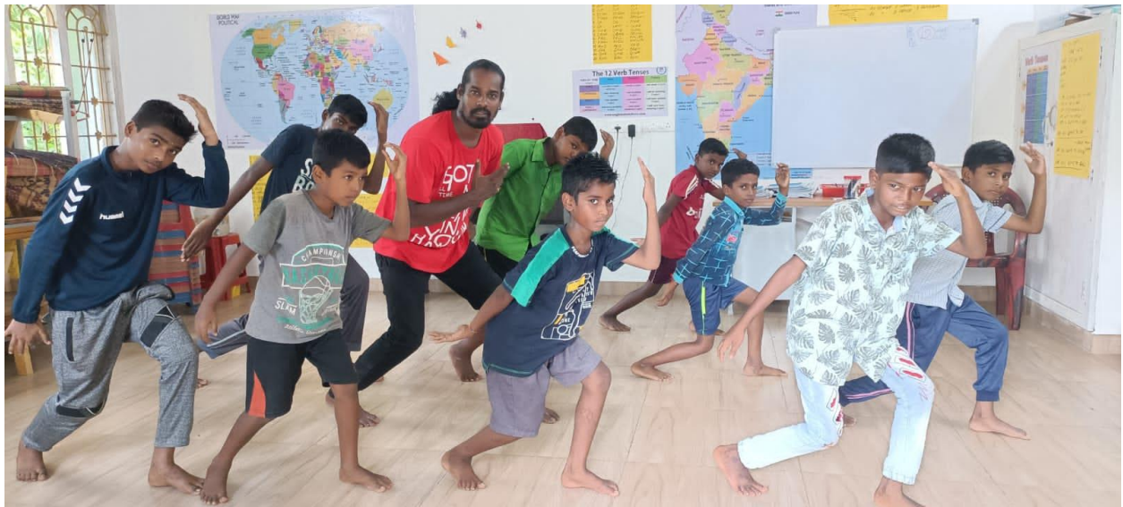
Boys dance class in Moratandi