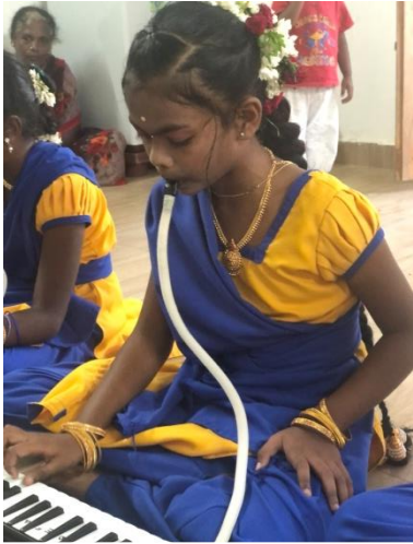
Music class in Kottakarai