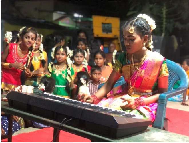
Festival program in Artsjarampet 2022