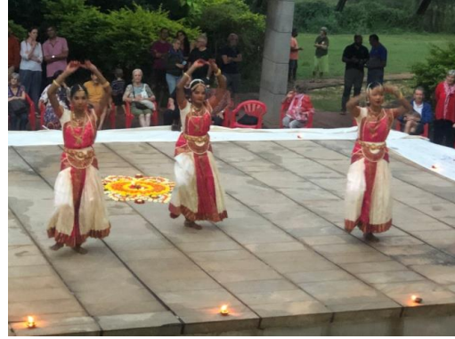
Dec 2022 program by town hall