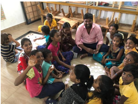
Paying games in Kottakarai 2022

We are teaching in 3 locations dance (2024).. In At present (2024) 2 locations Bharatanatyam dance (and folk dance): In Kottakarai colony (sinds 2021) and Mahaveerapuram colony (sinds 2024). In Moratandi we are giving street dance classes (sinds 2023). In Artjarampet we stopped in 2023 because the main person got an accident. We would like to continue later.