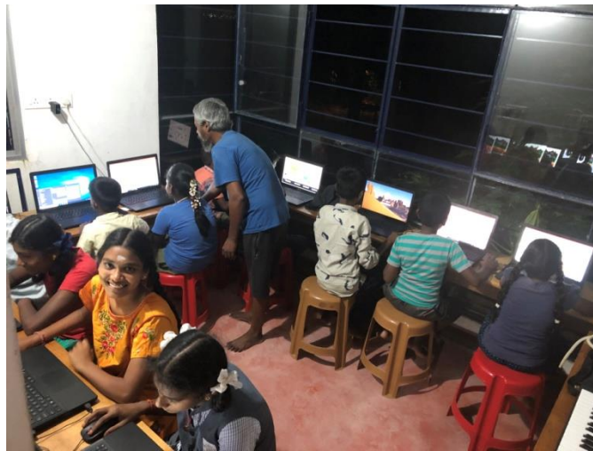
Computerclass in Kottakarai by Gurumurthy

We giving computer classes for 3 years now in 1 location in Kottakarai village.