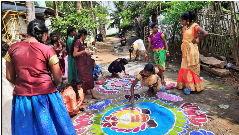
Kolum party in Mahaveerapuram