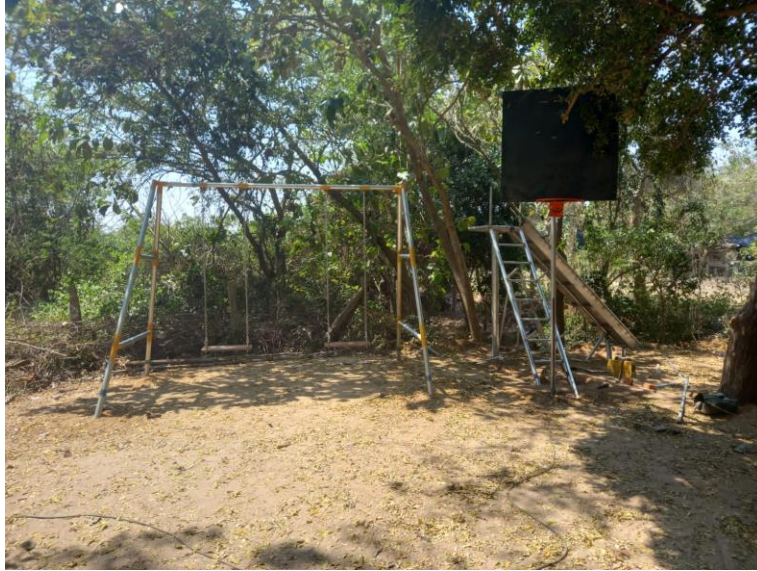
Playground in Kottakarai village