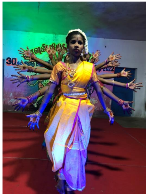
April 2022 festival Artsjarampet