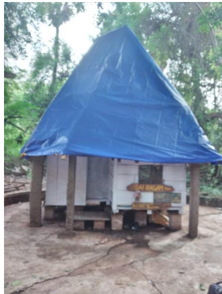
Isai Ragam office in fertile