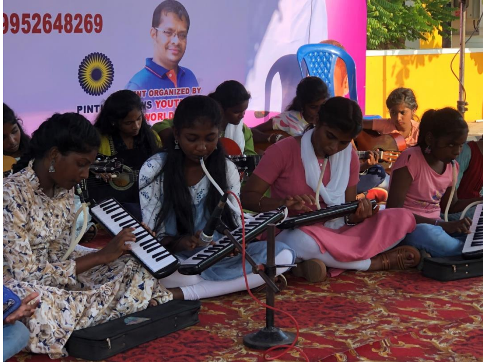
Pudhupakkam children doing music program in Pondicherry "Stage is yours"