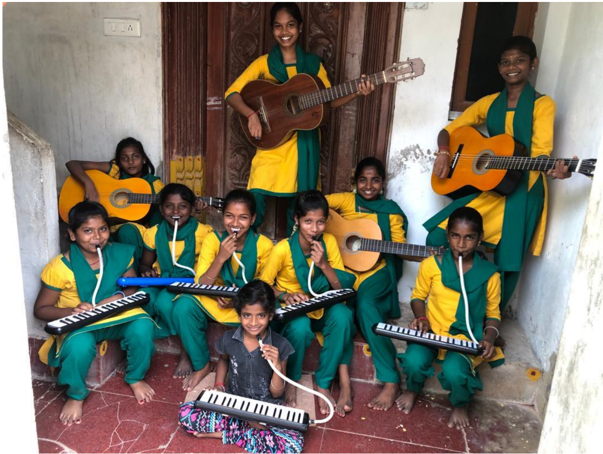
Children from Mahaveerpuram on melodica and guitar